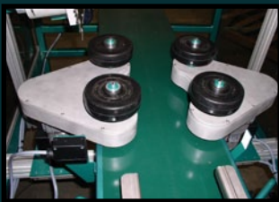
Pot turning wheels