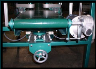
Pot size adjustment