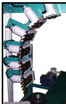
From concept to design